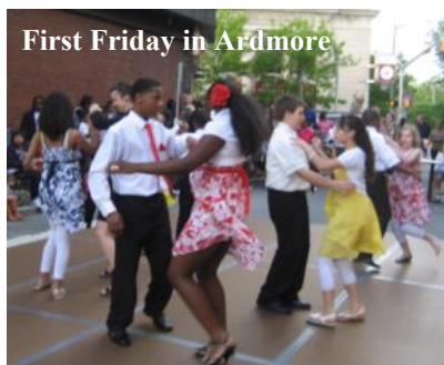
First Friday in Ardmore