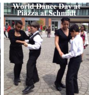
World Dance Day at Piazza at Schmidt

They've line danced with the Mayor of Philadelphia, performed a dramatic tango on the stage of the Kimmel Center, wowed the July 4th crowd at Penn's Landing's with a lively swing dance, and executed a spicy rumba at the Philadelphia Museum of Art - and they're only in middle school. "They" are the Dancing Classrooms Philly Allstars, the exhibition troupe of the Dancing Classrooms Philly (DCP) program.