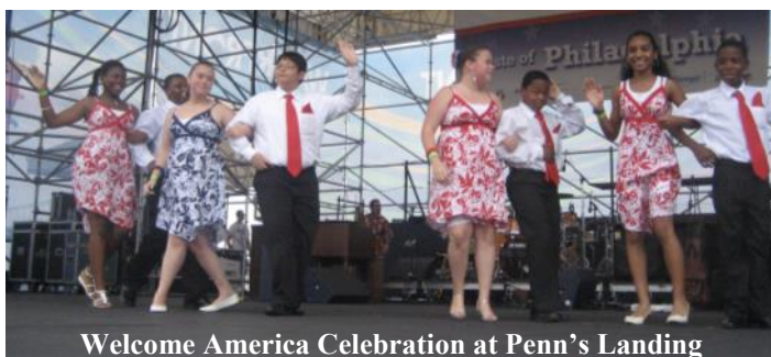
Welcome America Celebration at Penn's Landing