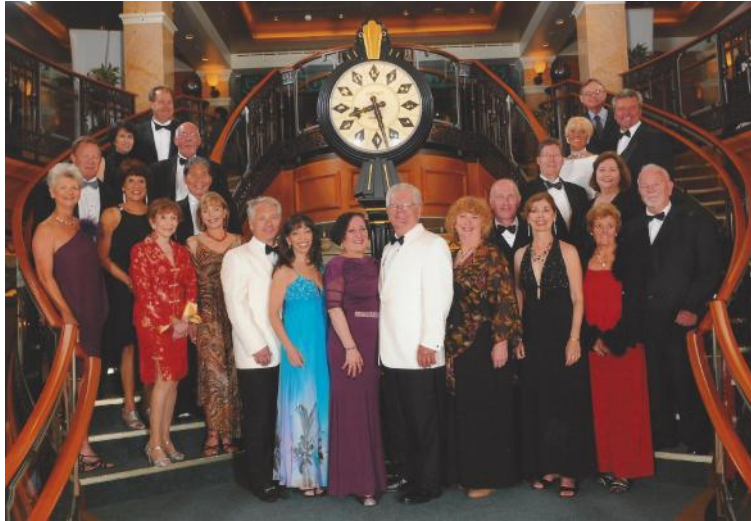
Most of the BLSDC August Mediterranean cruise group representing dancers from Florida to New York and Maryland to Wisconsin.

Cunard has a few other distinctions. Based out of Southampton, England and featuring the best transatlantic voyages, while many countries are represented on the ship, most of the passengers are English-speaking.