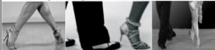
Eckse*Stephanie*GoGo*Capzio*Fred*Bloch*SoDanca*Sansha*Angelo Luzio*Wener Kern

Monday to Friday 10-7 * Sat 10-5 * Sun 12-3